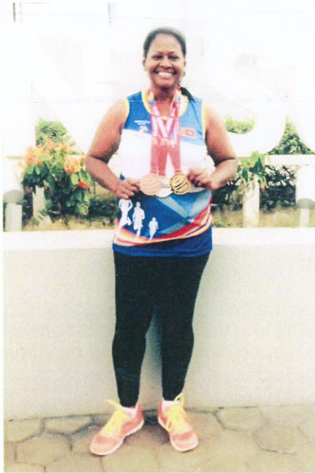
Gold Medal winner of Asian Master Athletic Championship held in Singapore