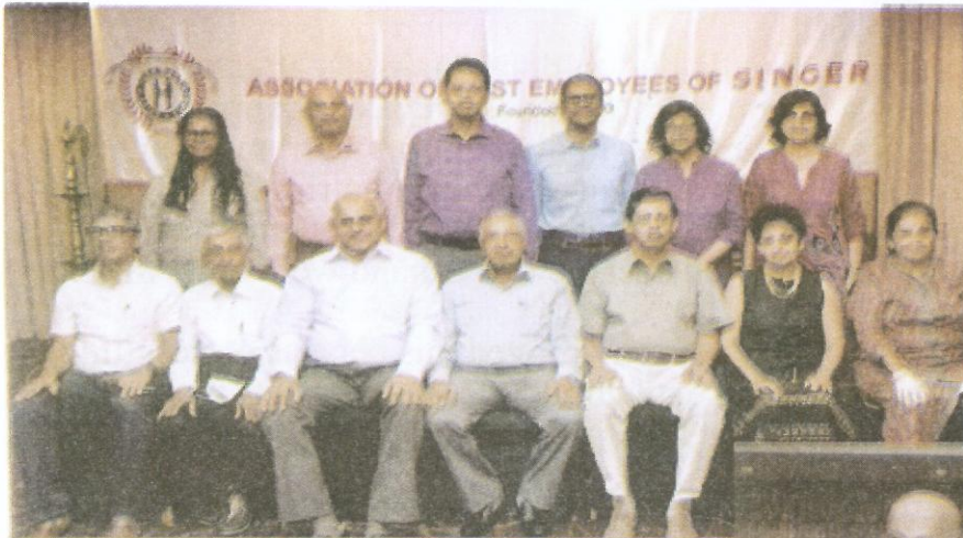
3. Newly elected office bearers of APES 2022