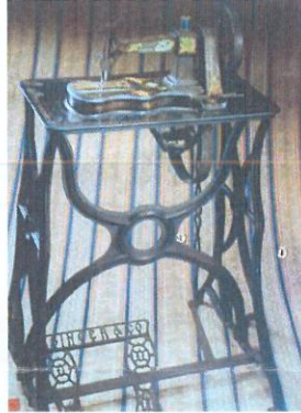
'A' type Machine with original stand