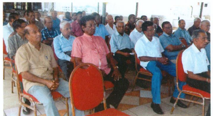
A Section of the members who attended the AGM