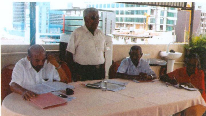
The President Addressing the members